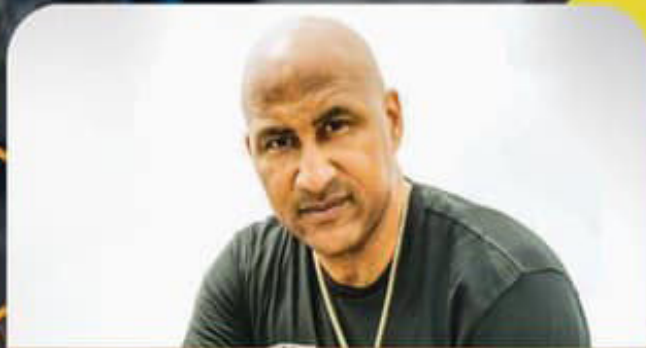
BIG DADDIE THE DJ