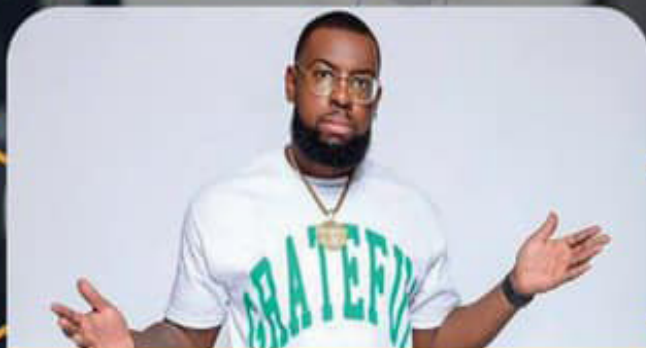
DJ DOES IT ALL